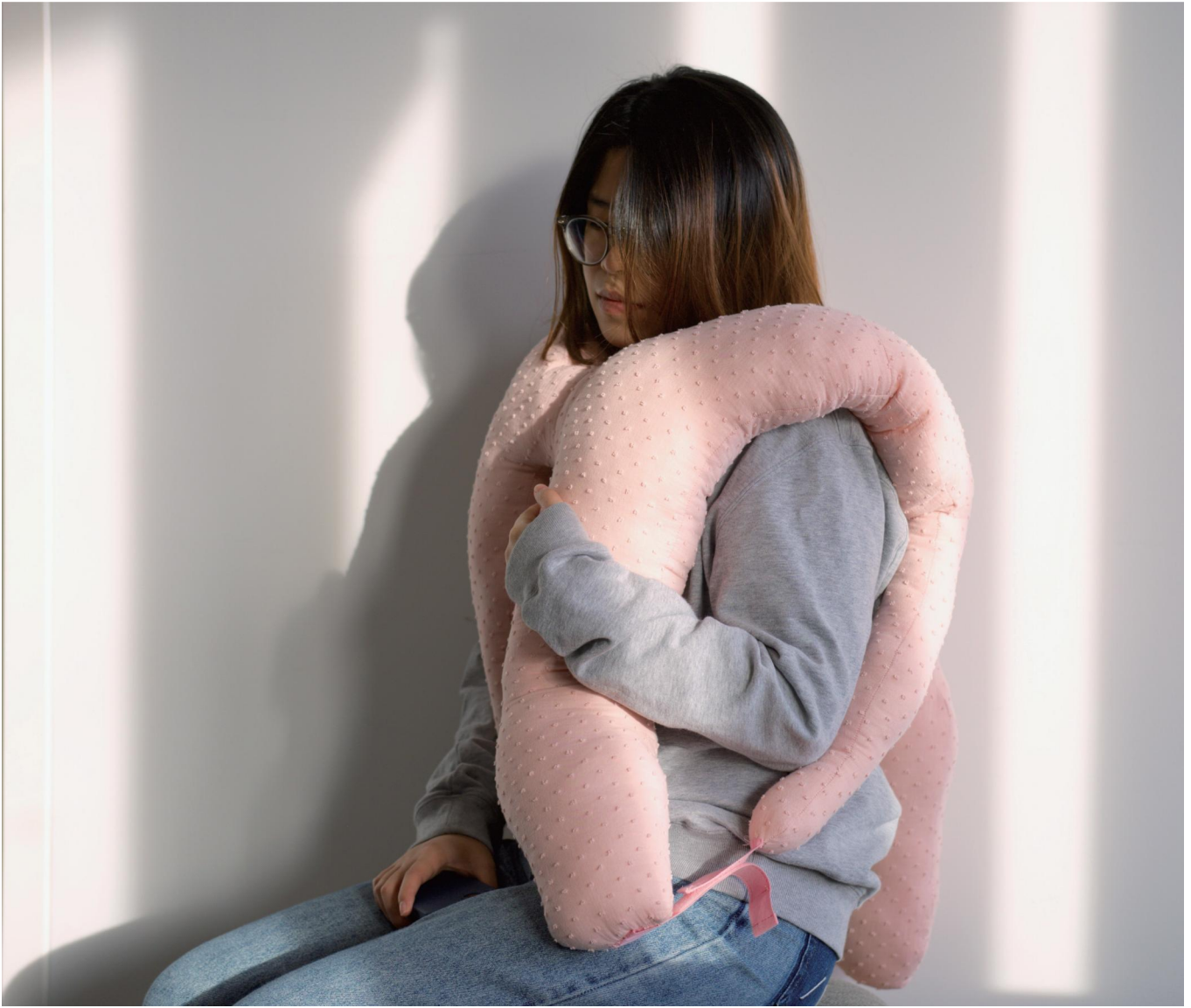
A wearable pillow for emotional hugs