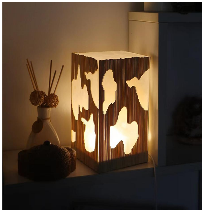
ZHUJIAN - A night light made by bamboo arrangement