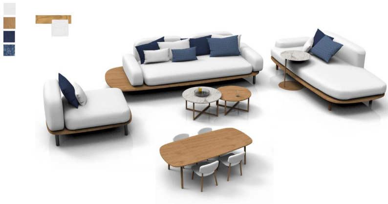
Furniture sets - in collaboration with Talenti