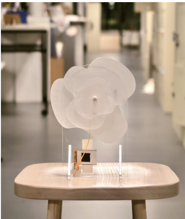
Floating cloud - Table lamps with rotating blades