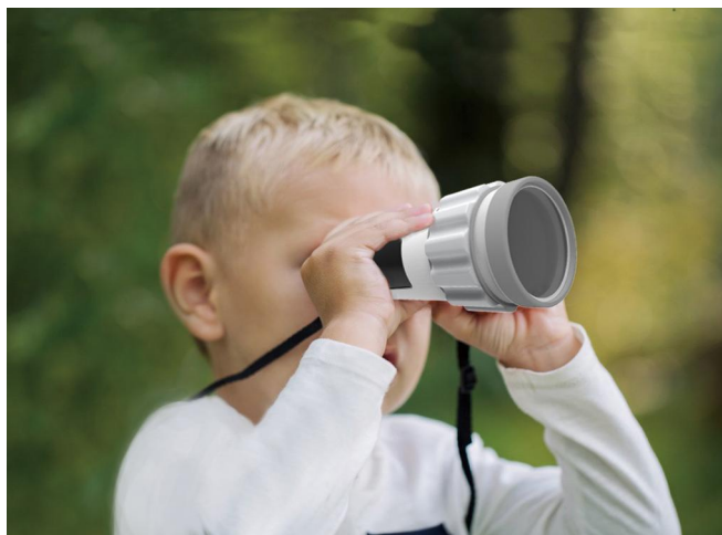
Cloud Telescope - Children's education